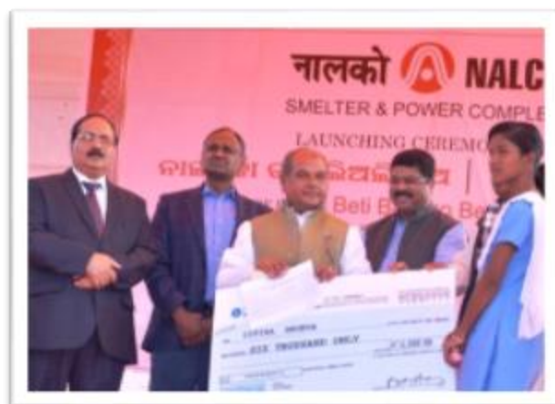
Figure 1: NALCO KI LADLIs are being felicitated by dignitaries at S&P Complex, Angul

Based on this flagship scheme of GoI, Nalco Foundation has introduced the “NALCO KI LADLI” Project to ensure learning and education opportunities for the meritorious girl students belonging from marginalized section and poor economic background in the districts of Koraput and Angul. The programme was initiated in the FY 2015-16 and successfully completed three years.