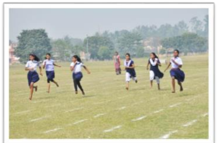
Figure 3: NALCO KI LADLIs participating in a sports event organised by NALCO Foundation