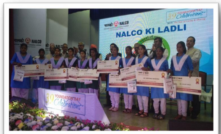
Figure 2: NALCO KI LADLIs are being awarded during 39th Foundation Day Celebration at Bhubaneswar

NALCO believes that education needs to be synonym with the integral development of the child which would contribute towards physical, intellectual and spiritual growth. With this conviction, NALCO, apart from supporting with financial assistance NF is also promoting and encouraging the girl students through events such as sports, extra-curricular and co-curricular activities.